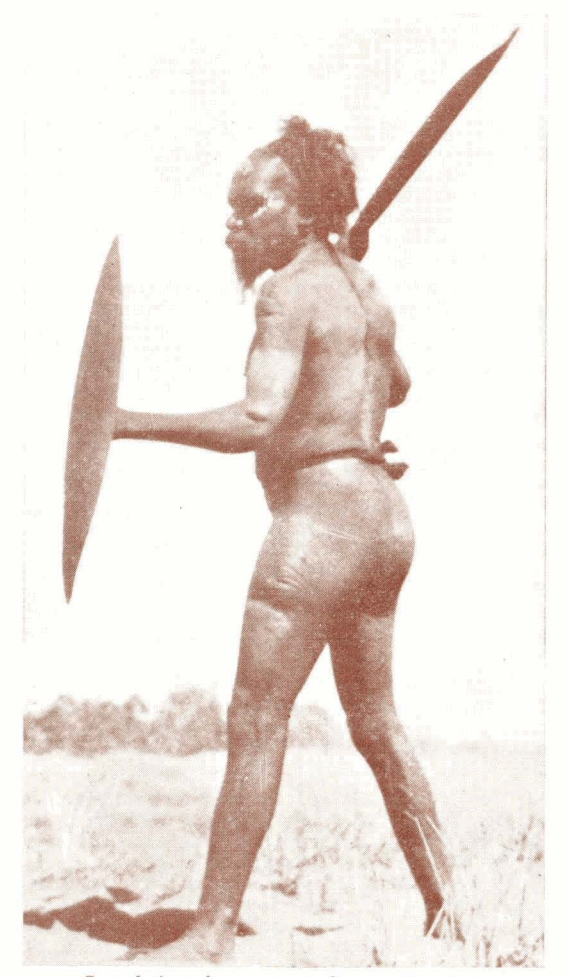
Central Australian native in his primitive state.